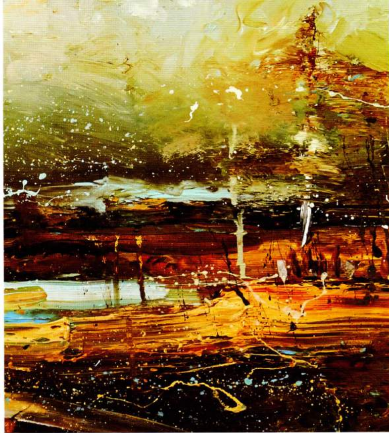
Saturated in spring (detail), oil and mixed media, 100 x 100cm FRONT COVER: Saturated in spring , oil and mixed media, 100 x 100cm PAGE 1: Sea Clearing , oil and mixed media, 90 x 90cm

Dr Sally Bulgin Publishing editor of The Artist magazine www.painters-online.co.uk