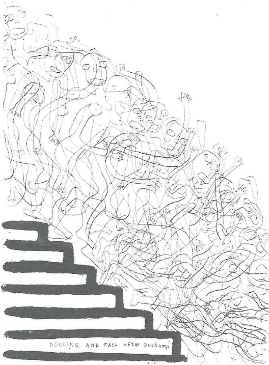
left: 'DECLINE AND FALL' after Duchamp. 40 x 30 cm. Hard ground etching with aquatint. Printed on 280 gsm Somerset soft white paper.