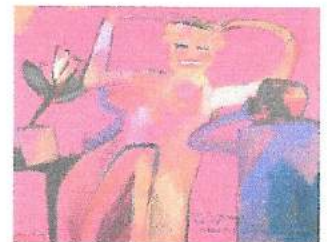
top: 'WHAT HAVE WE DONE WITH YESTERDAY'S TOMORROW?' 80 x 80 cm. Hexachrome digital print with silkscreen.

For more information on the artist visit www.gerrybaptist.co.uk